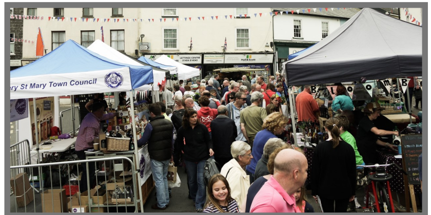
Great atmosphere at the Market during 2016 Festival